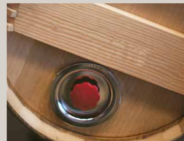
Stainless steel eco kit

With the development of accessories we have succeeded in simplifying this type of vinification to a maximum